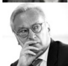
Hannes Swoboda , MEP, President of the S&D Group in the European Parliament