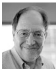
James K. Galbraith University of Texas, USA