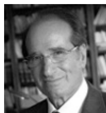
Jean-Paul Fitoussi LUISS University, Rome

President of the S&D Group in the European Parliament